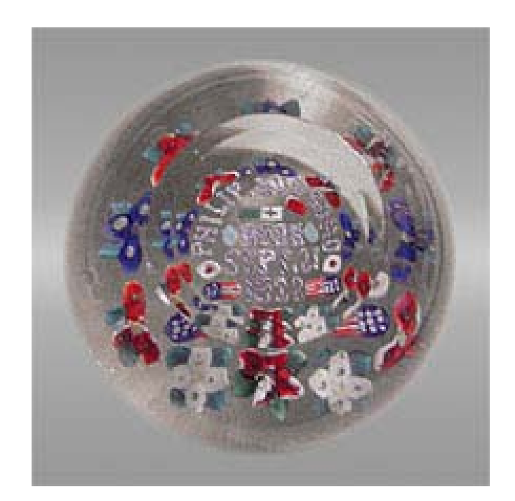
Figure 13. Figure 14.