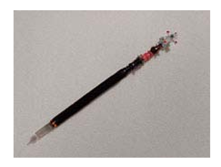
Figure 15. Figure 16.