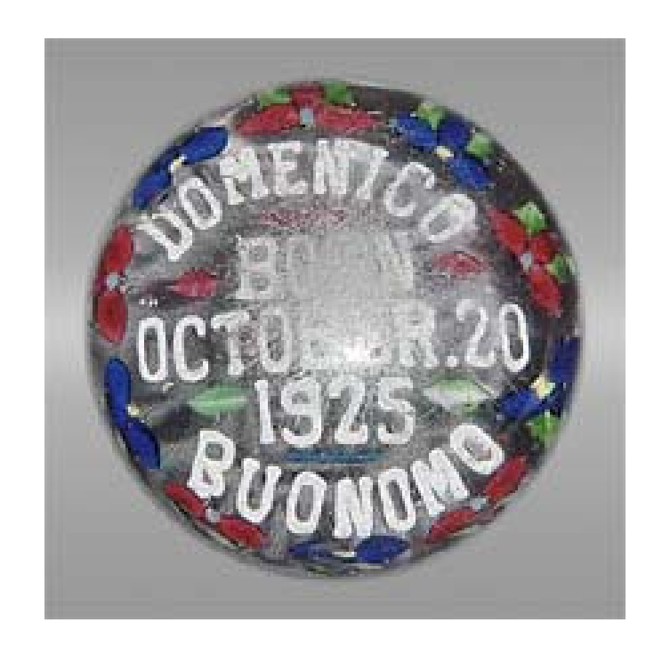
Figure 7. Figure 8.