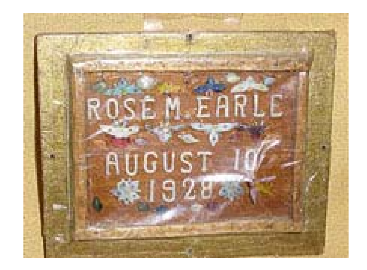
Figure 17. Figure 18.