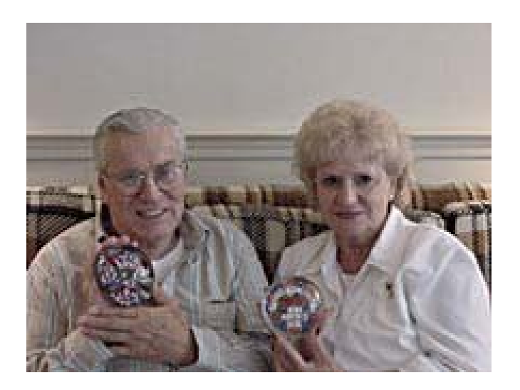
Figure 1. Figure 2.